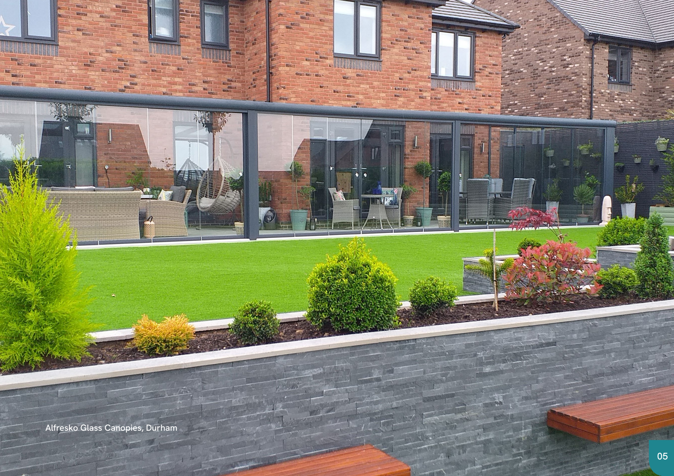
Alfresco Glass Canopies, Durham